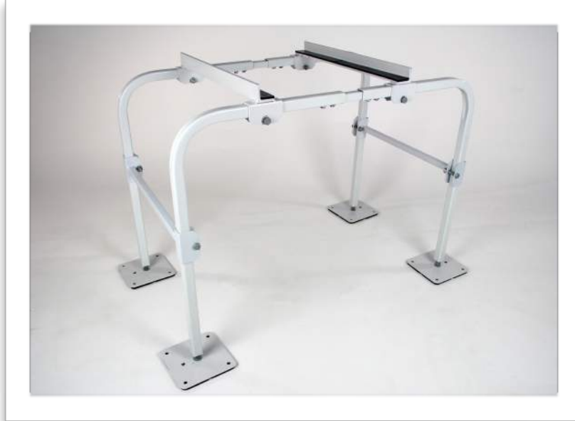
Vertical Air Handler Stand QSTD5000, QSTD5001, QSTD5002

Applicable for residential or light commercial installations